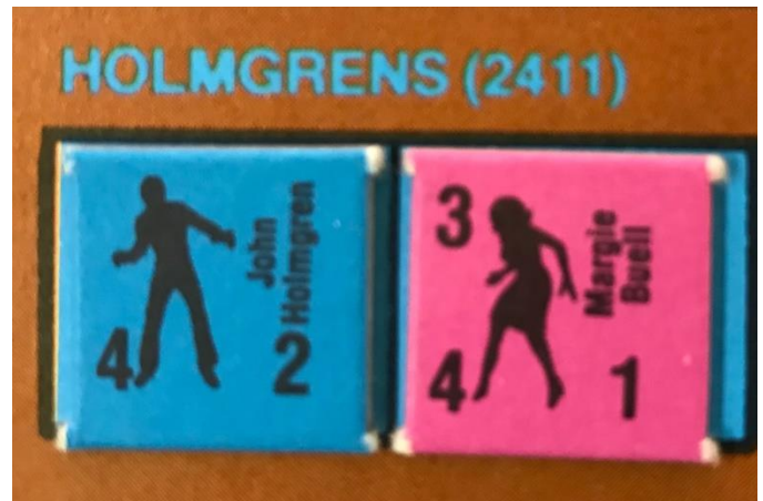
(Game character tiles, including John Holmgren and Margie Buell (aka, Allard?))

BUG-EYED MONSTERS has two scenarios; in one, the aliens land to capture human women and take them off in their spaceship. In the other, they land to capture presidential hopeful Dwight D. Eisenhower, campaigning in New Hampshire in preparation for the Republican primaries. Breaking the stillness of a quiet winter night in the little town of Freedom, New Hampshire, is a crack of thunder, quickly muffled by snow. They have arrived. On silent grey sleds, they slide through the forest, readying their lasers and stunners, drooling slightly in anticipation. They choose their first target: a little clapboard house nestled in the woods above town. They attack. The sounds of lasers and stunners are soon met by cries of fear and rage. Wild with lust, they fail to notice when one human makes it to a car, and careens away, to rouse the citizenry of the small town against the alien threat. Ugly, slobbering, bug-eyed monsters! They land in remote American towns and make off with women!