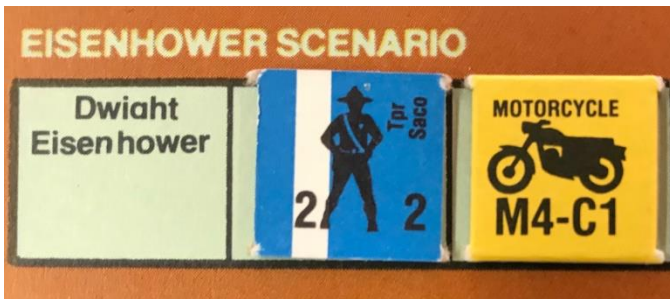
(Eisenhower & police tiles)

If, at the end of the game, the BEMs have kidnapped Eisenhower and have moved him into the space-ship, the BEM player wins. If, in addition, he has lost one or no BEMs in the course of the game, he wins a decisive victory; if he has lost two to four, he has won a substantial victory; if he has lost five or more, he has won a marginal victory. If Eisenhower is killed, the game is a draw. If Eisenhower is neither killed nor captured, the human player wins. If he has killed at least five BEMs, he wins a decisive victory; if he has killed one through four BEMs, he wins a substantial victory; otherwise, he wins a marginal victory.