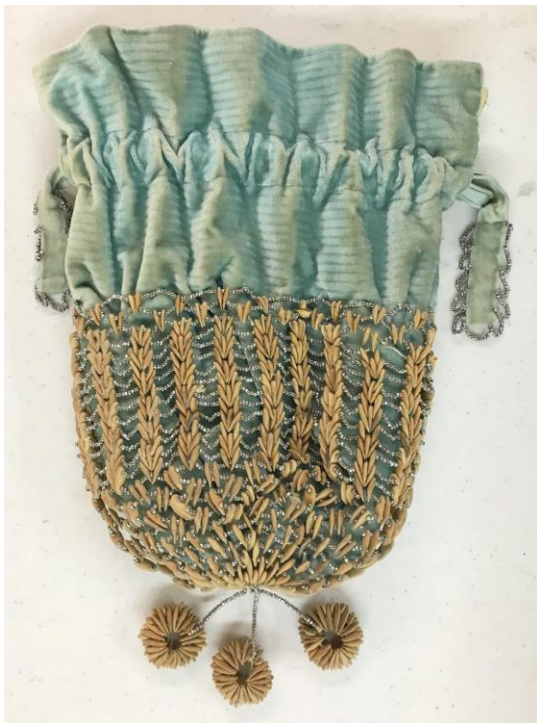
Circa 1870's Women's purse in FHS collection. All the brown things on the purse are actually

seeds sewn into the piece. Special preservation to avoid any moisture is important here.