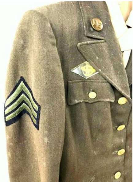
FHS WAC uniform showing white mold.

All the above materials have risks due to what are called “inherent vices”; in other words, because of the nature of the materials themselves, they are at risk from damage or destruction. And, most importantly what steps does a museum take to protect the items it owns? This is where a “risk assessment” comes in and is part of a larger effort called a collection management plan. This plan involves a condition assessment, mitigation methods, storage recommendations and scheduled inspections to insure that the collected items are safe and secure over time.