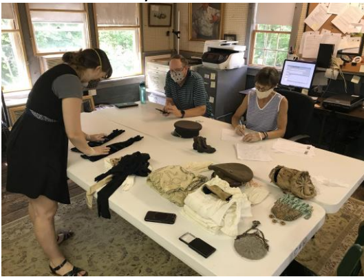
The assessment team at work!