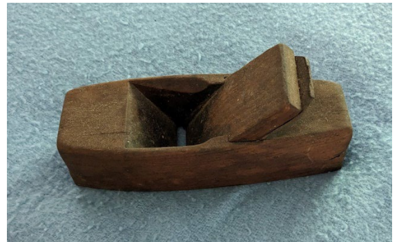
Wood Coffin Plane, unknown MFG, probably late 19 th early 20 th century. It is a smoothing plane named for its coffin shape.