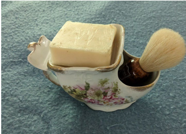
Vintage Shaving mug with soap and brush