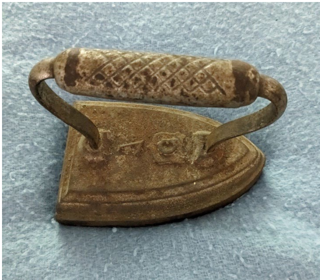
Flat Iron. Based on symbols it appears to be a late 1800's military iron, possibly French. These types of irons are commonly used as door stops now.