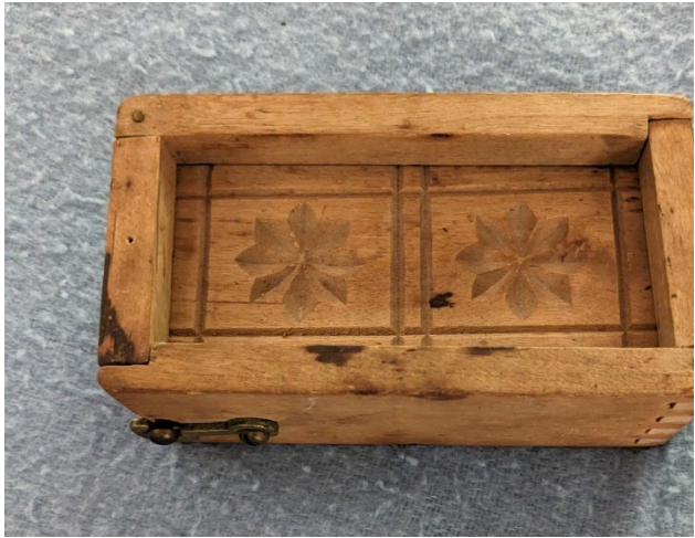
Wood Butter Mold- became popular in the Late 19 th or early 20 th century both in private kitchens and for decoration and on farms as an early type of “Trademark”. Usually made of hardwood. Note latch on side to open mold